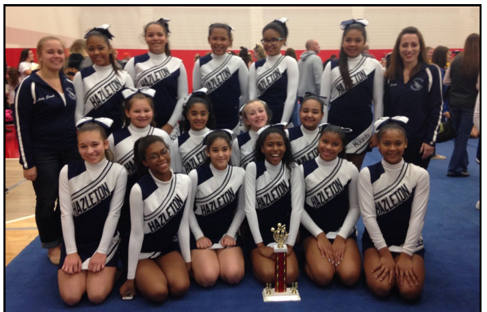
2nd Place 2015 Cougar Rumble Competition

The girls future plans include another competition this winter, as well as cheering for the boys' and girls' home basketball games.